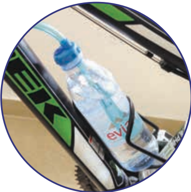
■ PET Bottles Option