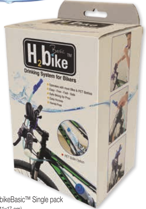
H2bikeBasic™ Single pack (9x11x17 cm)

Contains: 1.0 / 1.20 Meter Drinking Tube, Bite-Valve (on/off), 28+30+63mm Caps & Adaptors (Include One Direction Valve), MultiFix™ Cone, 2 x Silicon ladder straps + 2 x Half moon silicone units (for better attachment on Handlebar), Available: SpiralTube™, Other Accessories, Alternative Caps and more.